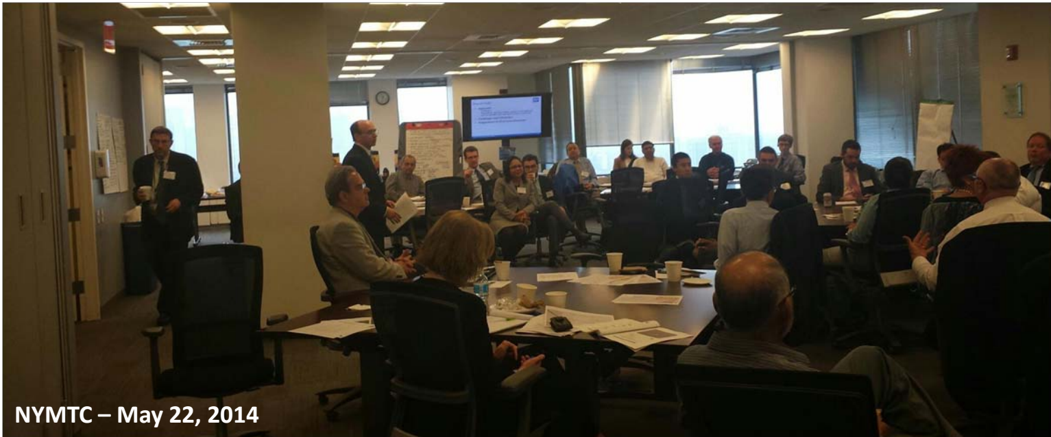
NYMTC – May 22, 2014